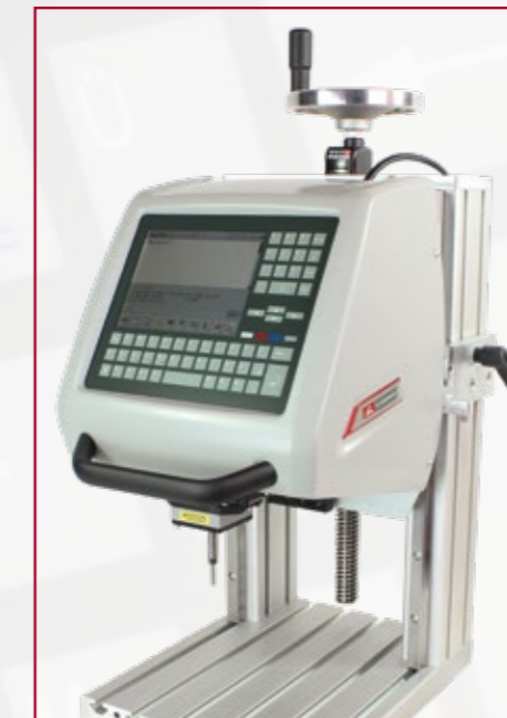
Column frame with handwheel (optional)