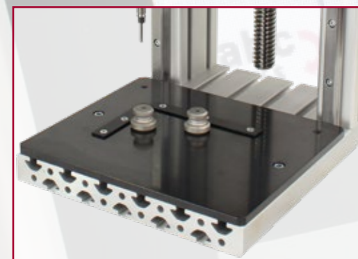
Type-plate with fix stop limit bars (optional)