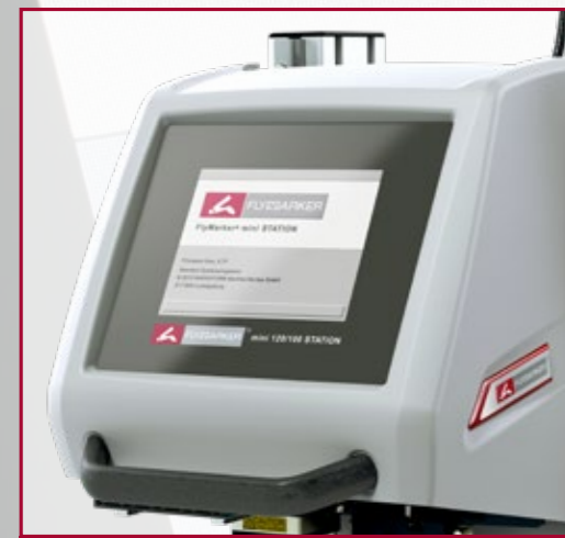
Available without touchscreen Input via USB keyboard