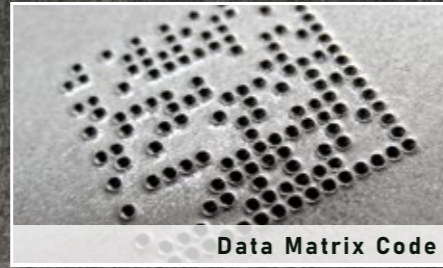
Data Matrix Code