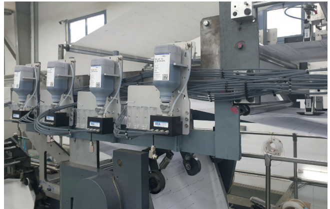
Bulk systems in large printing plant