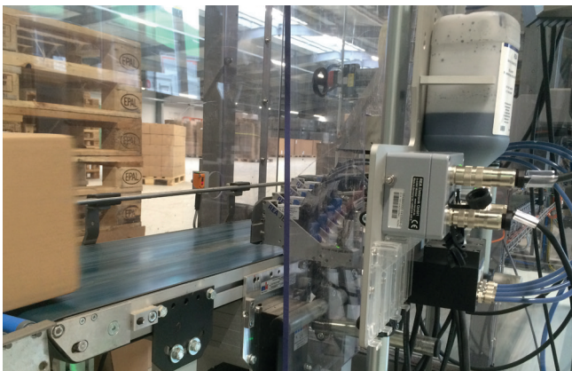
Marking of cardboard boxes