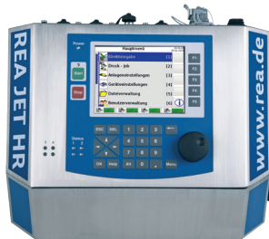
HR Controller for up to 4 print heads