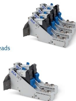
HR print heads