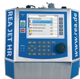
HR Controller for up to 2 print heads