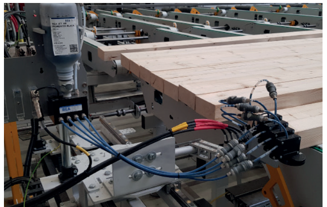
End marking of glued lumber