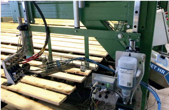
Wood marking in the run

A regulator can be connected to each hose leading from the reservoir. This ensures that the necessary pressure and ink flow to the connected bulk cartridge is available at all times. A level sensor in the reservoir ensures that the system does not run dry.